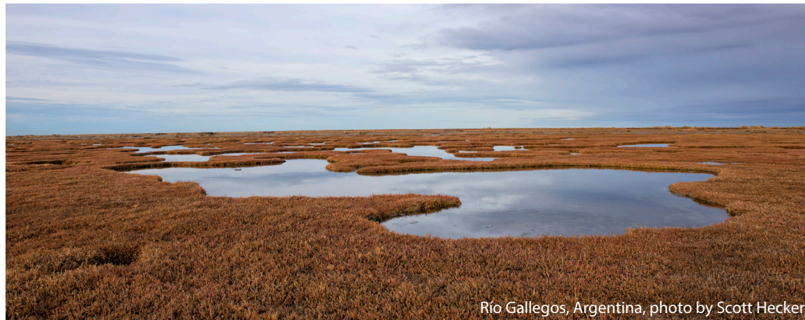
Río Gallegos, Argentina