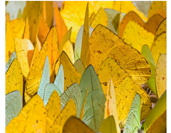
These are not leaves but butterflies!

Advocacy: The Kayapó marched in solidarity with other indigenous peoples in two national mobilizations for indigenous rights in Brasília. The Brazilian congress is threatening to weaken indigenous land rights. Protests on the steps of Congress gain national media attention and are one of the few options indigenous people have to fight back effectively.