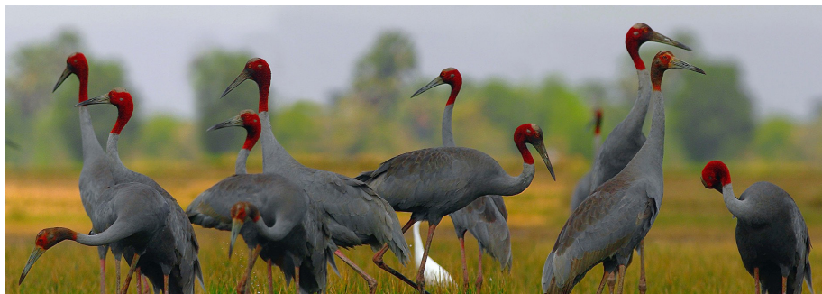
Sarus cranes at Phu My Nature Reserve in Vietnam.

Field partner: International Crane Foundation