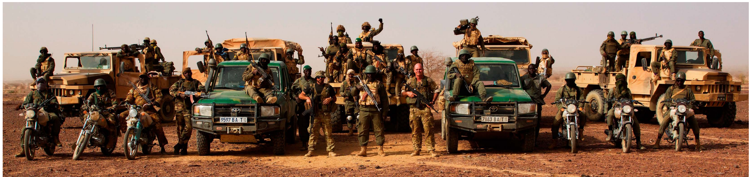
Called "the gentle army" by local people, Mali's anti-poaching unit received elite training from Chengeta Wildlife, who employ an intelligence-driven approach combining investigative skills, tracking skills, and the nurturing of sympathetic sources in local communities.