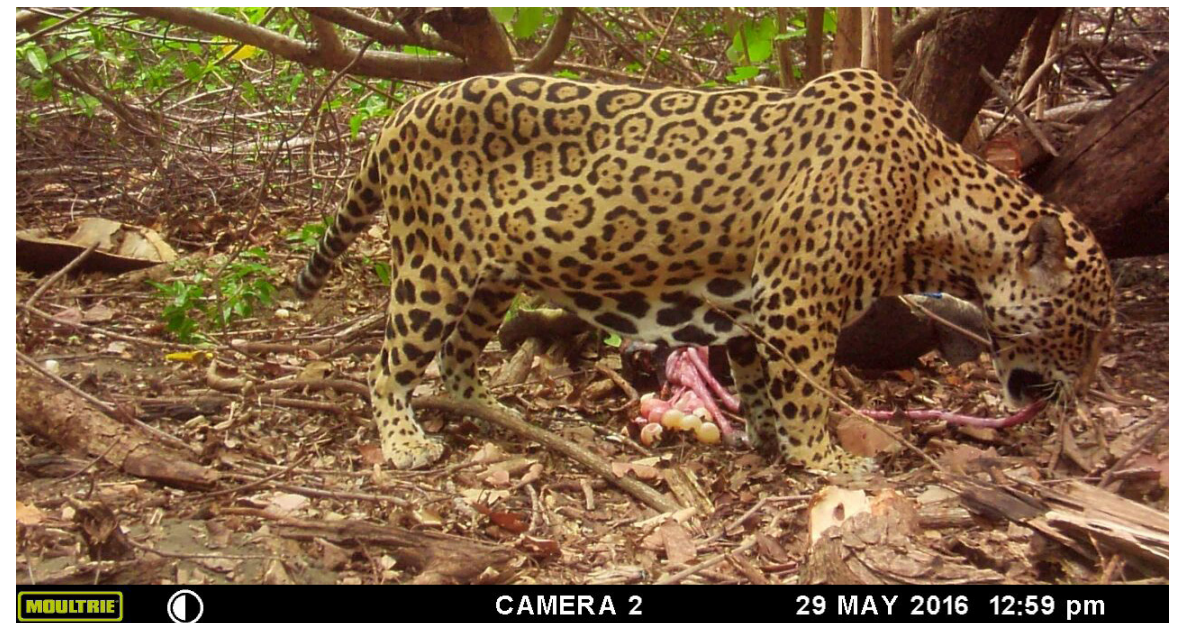
Camera traps capture rarely seen animals like this jaguar at Playa Nancita, Area de Conservación Guanacaste in Costa Rica .

Paleontologists use the term mass extinction for periods when the Earth loses more than three-quarters of its species in a geologically short interval, as has happened five times in the past. In recent centuries hundreds of vertebrate species have gone extinct, a rate more than 100 times the "background" extinction rate. Some scientists believe that this represents an incipient sixth mass extinction – one that can still be largely averted through intensified conservation efforts.