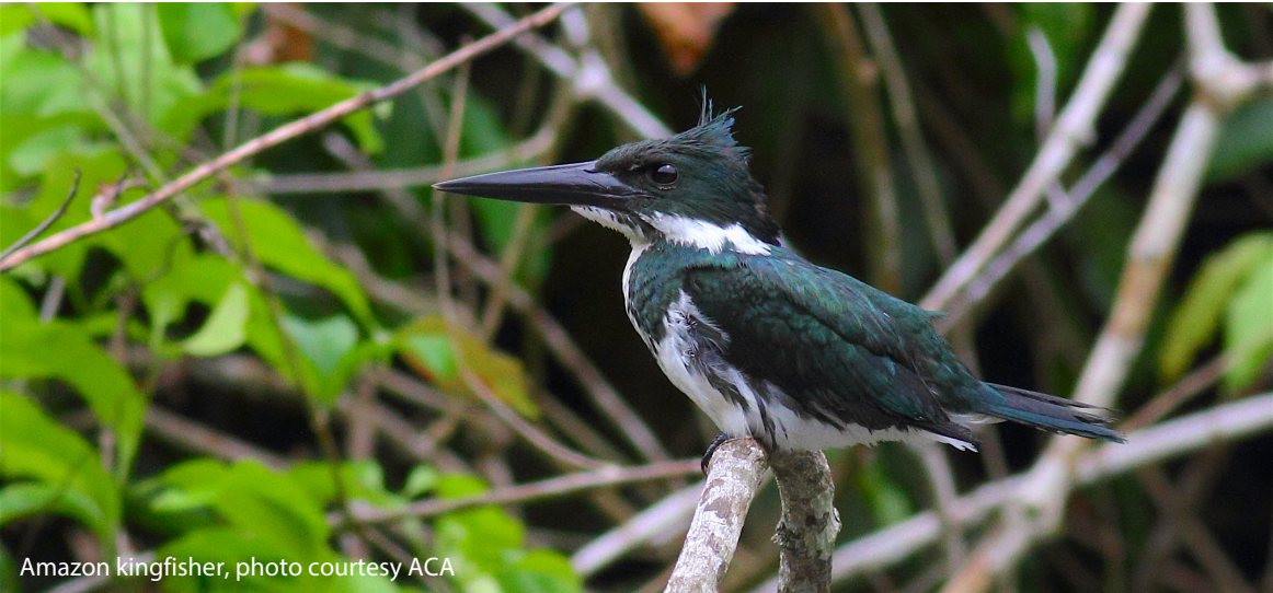
Amazon kingfisher

Field partners: Amazon Conservation Association and Asociación para la Conservación Amazónica