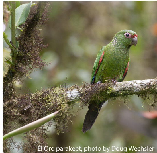
El Oro parakeet