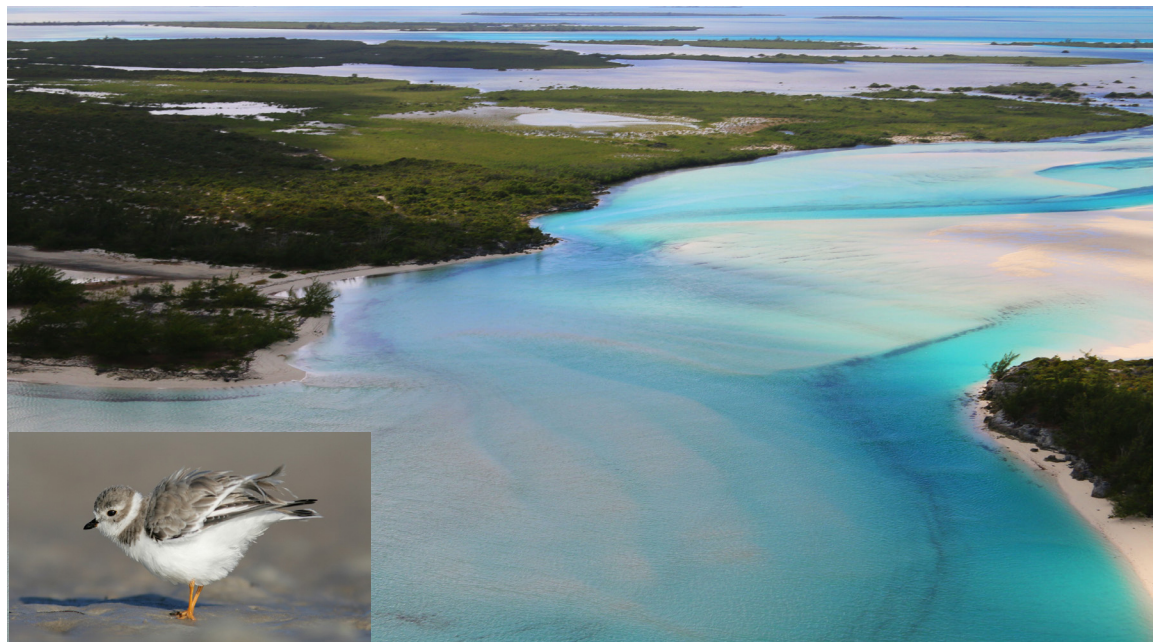
Joulter Cays is one of the most important wintering sites for the piping plover. Inset: piping plover in winter plumage.

This the first effort in the Bahamas to implement on-the-ground measures to limit human-caused disturbance and control invasive Australian pine at key sites for piping plover and other waterbirds. A long-term goal is to develop local capacity for coastal stewardship.