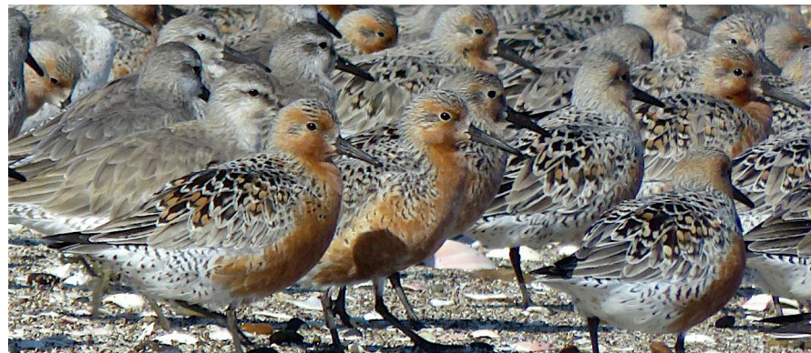
Red knots in April at Bahía de San Antonio, Argentina.

Of the 50 species of shorebirds that breed in Canada and the US, 41 migrate to overwinter in countries south of the United States. For “our” shorebirds to survive they must have sites to find adequate food and rest in 48 other countries and dependent territories, just in the Western Hemisphere. (Some even migrate into the Eastern Hemisphere!)