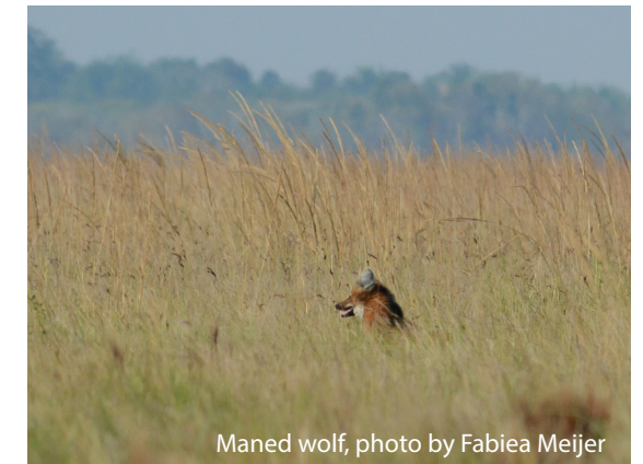
Maned wolf