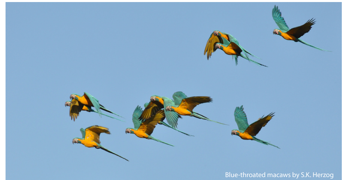
Blue-throated macaws by S.K. Herzog