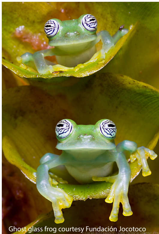
Ghost glass frog courtesy Fundación Jocotoco LUCAS BUSTAMANTE | WWW.TROPICALHEMPING.COM