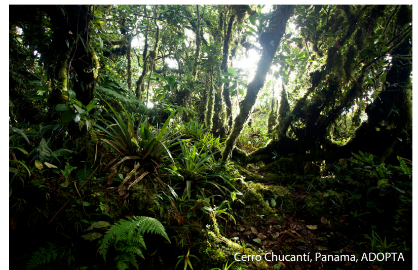
Cerro Chucantí, Panama, ADOPTA