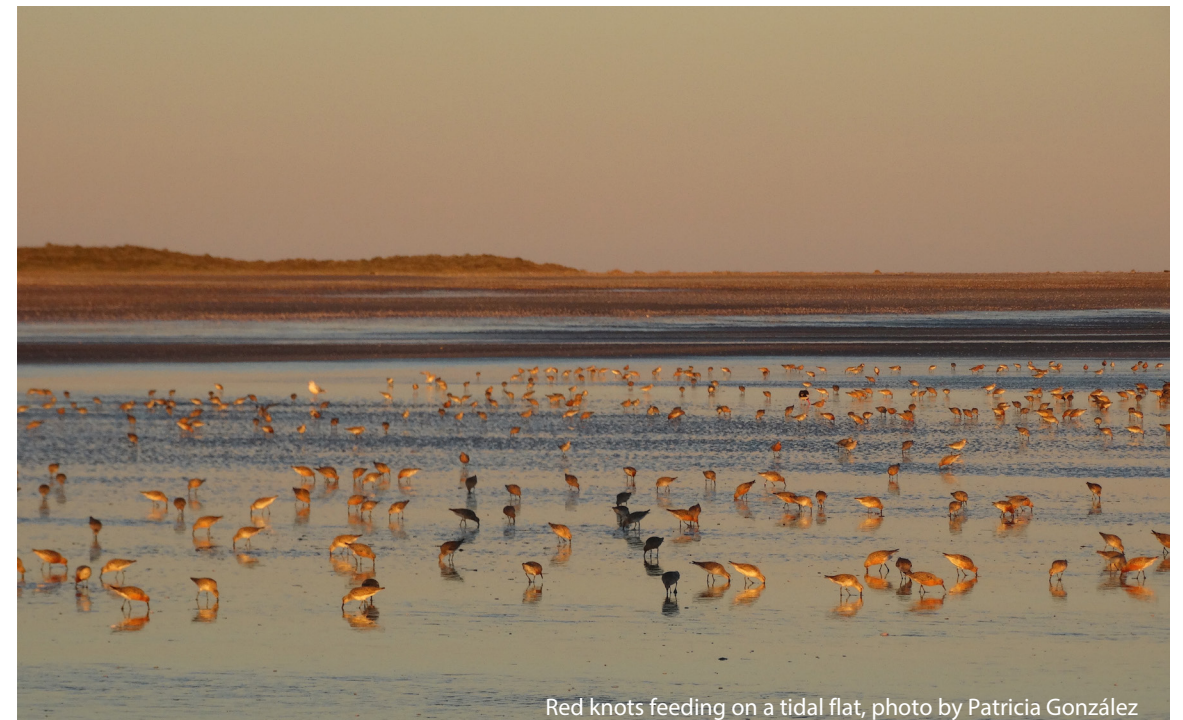
Red knots feeding on a tidal flat