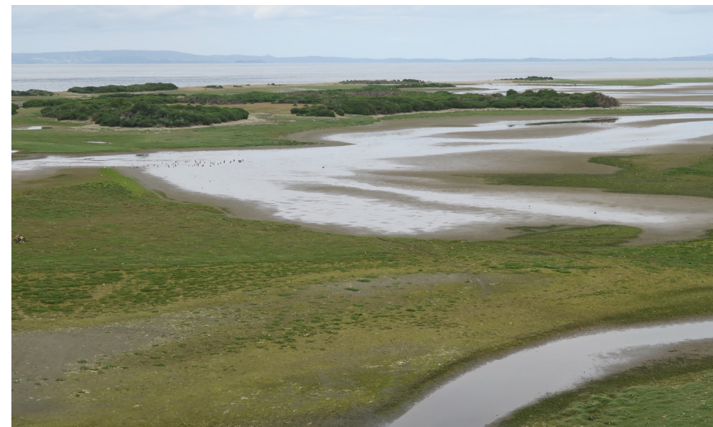
Humedal Laguna Quenuir in Chile.

Two wetlands have been designated as municipal coastal reserves, and the WHRSN designated five wetlands as a Site of Regional Importance. Progress was made on a management plan, and completed are three bird observation platforms, signage, and printed and online information materials, including a field guide.