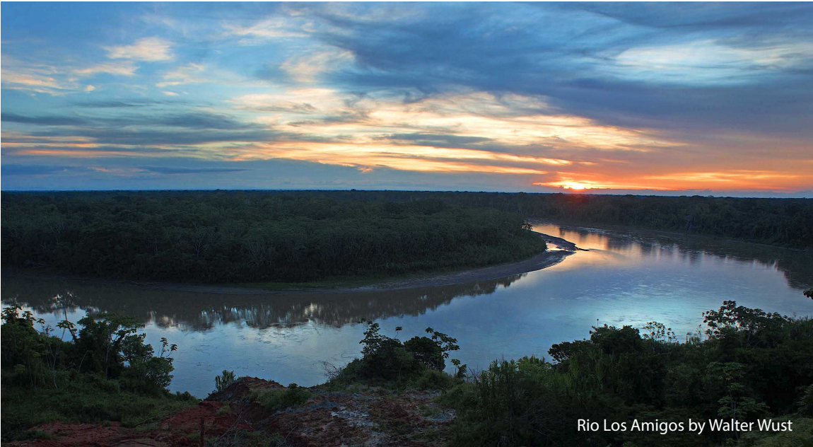
Rio Los Amigos

Field partners: Amazon Conservation Association and Asociación para la Conservación de la Cuenca Amazónica (ACCA)