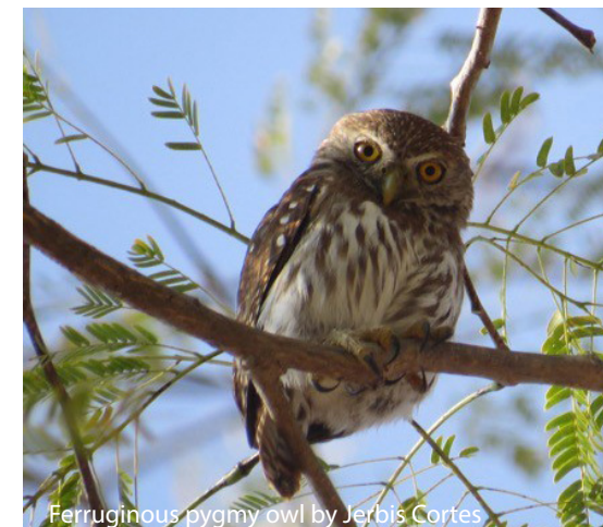
Ferruginous pygmy owl by Jerbis Cortes

Want to make something big happen? Please talk with us! We always have a wish list of things we'd like to do if we had additional resources and we'd love to discuss the possibilities.