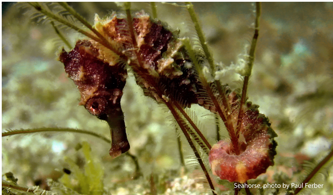
Seahorse