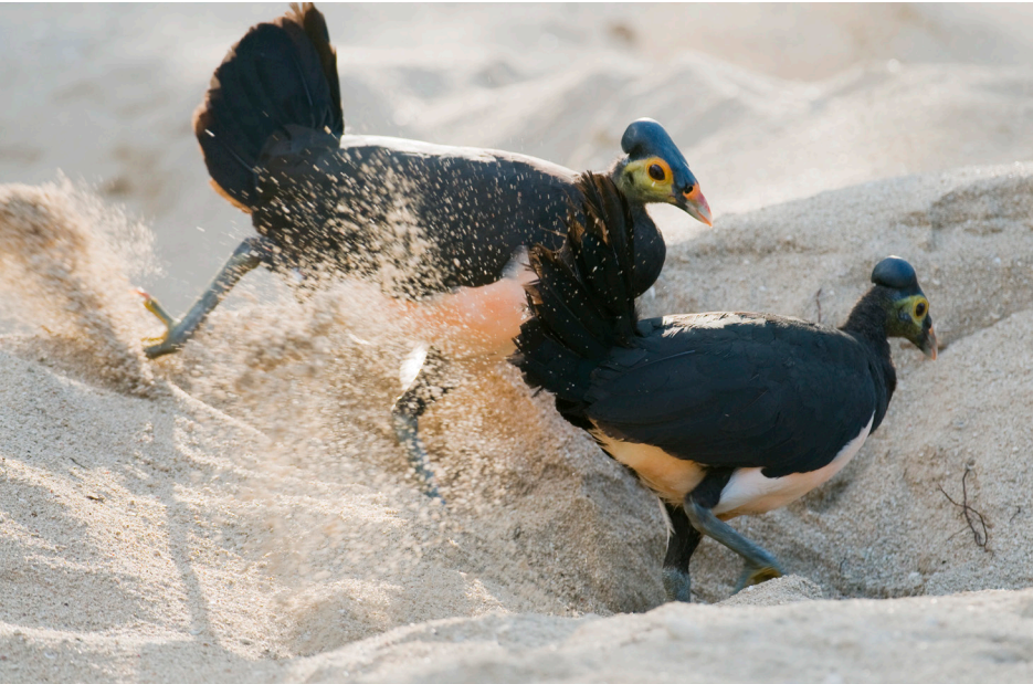
Maleos digging out their nest.

Timeframe: ongoing since 2010 Cumulative funding to date: $641,001 Size of area: 250,000 hectares (2,500 km²) Field partner: Alliance for Tompotika Conservation (AITo)