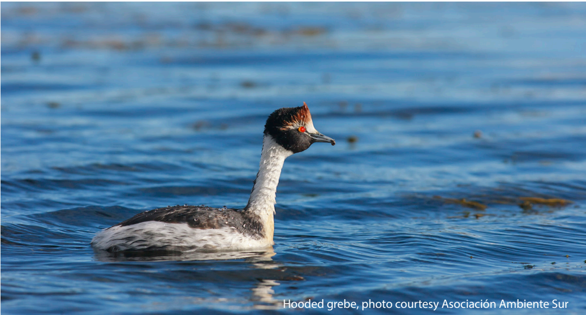
Hooded grebe

Timeframe: ongoing since 2012 Cumulative funding to date: $244,251 Field partner: Asociación Ambiente Sur