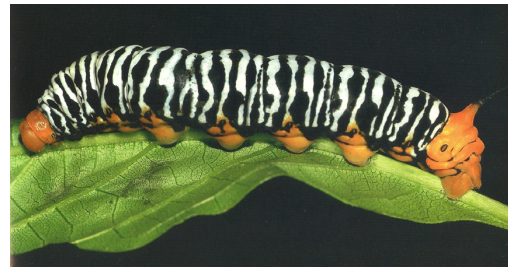
Parataxonomists have carried out comprehensive research on all life stages of Lepidoptera at ACG, as illustrated by these caterpillars.