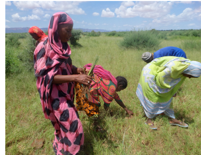
Women planting vetiver grass, which is used as an alternative to charcoal for energy.

Mali's "desert elephants" make the longest annual migration in Africa. In this arid region, competition is high for access to water and forage among pastoralists, elephants and "prestige cattle herds" (owned by wealthy city dwellers). Yet much can be done to reduce conflicts and align human and elephant interests.