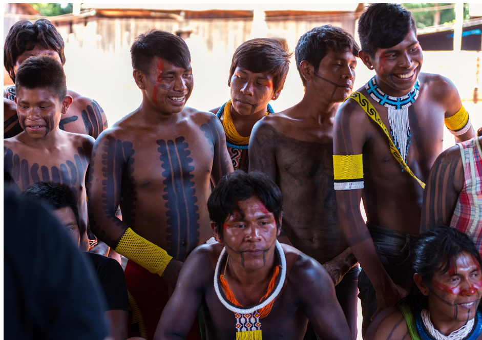
The Kayapó with their body paint, adornments and coordinated war chants and dances are considered by the indigenous movement in Brazil to be essential participants in protests in defense of indigenous land rights.

Field partners: Associação Floresta Protegida, Instituto Kabu, and Instituto Raoni