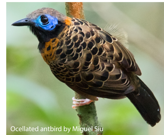
Ocellated antbird

Three properties totaling 105 hectares were purchased with funding from ICFC and Rainforest Trust to expand Cerro Chucantí reserve. Thanks to a generous donor, we made a downpayment on a fourth property of 64 ha. ICFC will continue to work with ADOPTA, which owns and manages