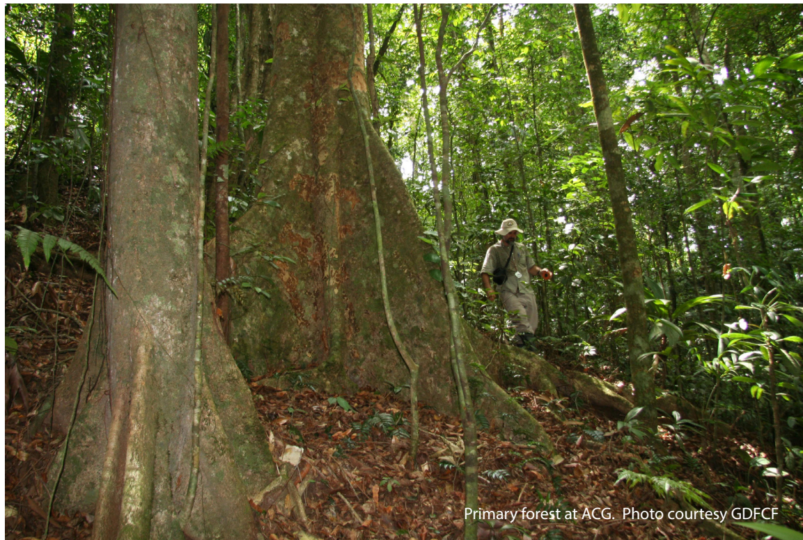
Primary forest at ACG.