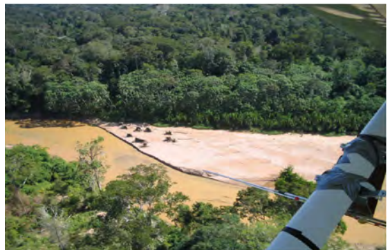
Signs of uncontacted indigenous people near the Los Amigo Conservation Concession.

We need help to reach our goal of US$2 million for the trust fund. See next page for the carbon benefits from this project.