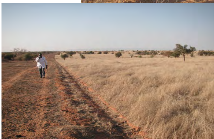
Firebreaks are labour intensive, but effective. 525km were completed in 2015.