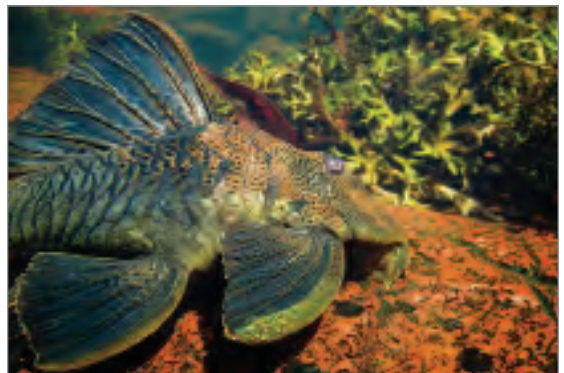
Kayapó lands are home to diverse aquatic and terrestrial ecosystems.

This project needs substantial funds to support the crucial management and operations of our Kayapo partner organizations.