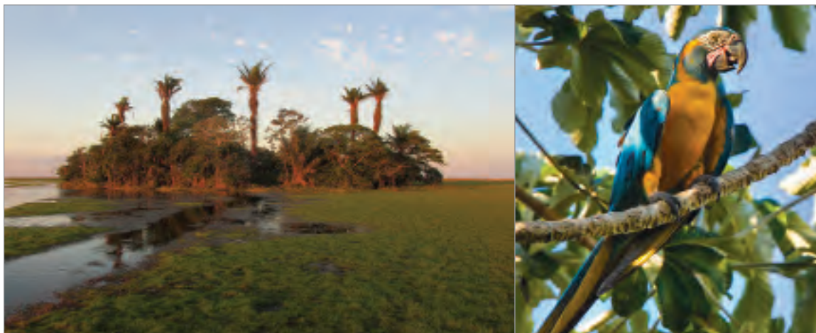
The palm islands embedded in Barba Azul's flooded grasslands provide blue-throated macaws with their chief food (Motacu palm fruits) and nesting cavities.

Asociación Armonía is seeking additional funds to complete the reserve's tourist facilities intended to help achieve its financial sustainability.