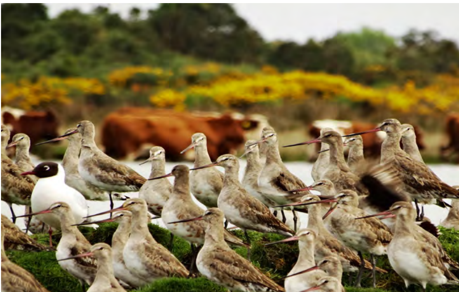
Cattle (background) pose threats to shorebird habitat: a solveable problem.