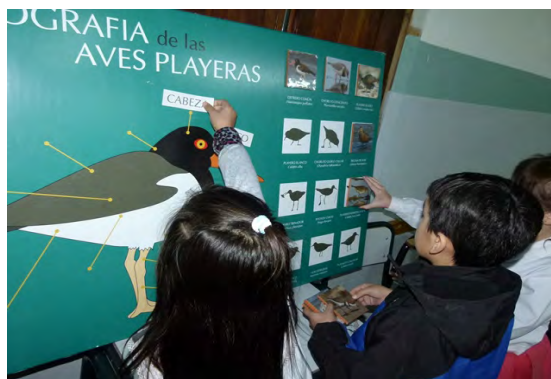
Children learn about shorebirds.

Maullin wetlands, Chile — Three new wetland reserves totaling 970 hectares are in the works. Protected status will address issues of habitat degradation from unregulated recreational activities and livestock trampling. This project