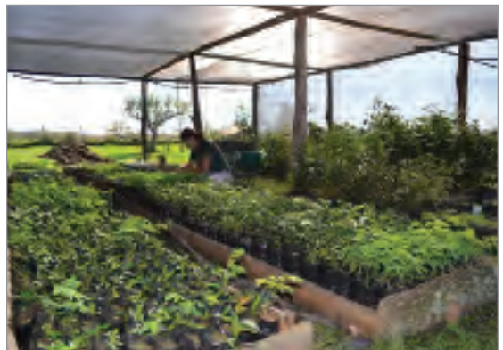
Native tree nursery at Rincón Santa María.

This project entails replacing invasive tree species with native flora. The project enjoyed a productive first year in 2015: a nursery for native tree seedlings was established; 300 saplings were planted, and 300 hectares of grassland were cleared of invasive trees.