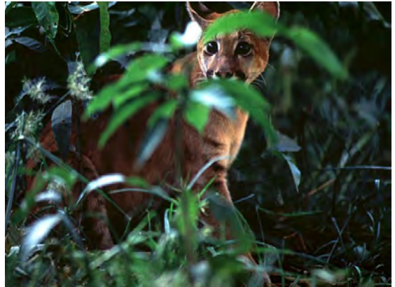
Juvenile puma: © Amazon Conservation Association