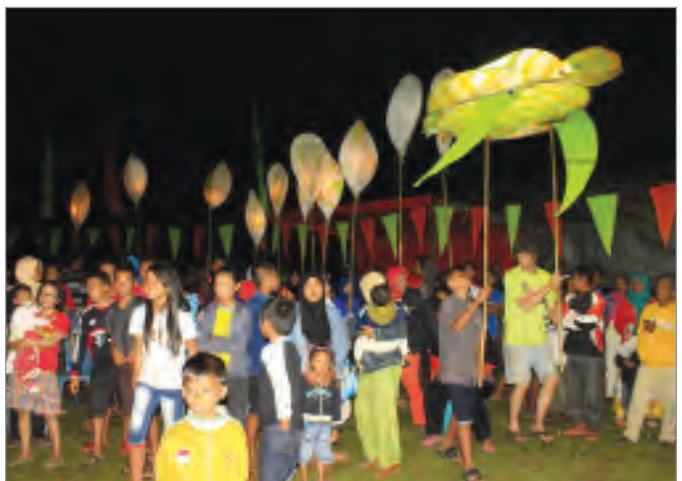
The Festival closing: lantern parade.