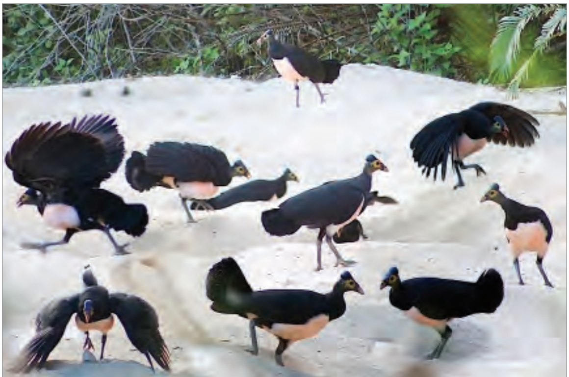
Rush hour at the maleo's nesting ground near Tompotika's village of Taima.

Sulawesi is a global biodiversity hotspot with numerous species found nowhere else. The Tompotika peninsula where we work has a good representation of Sulawesi's characteristic natural habitats, including montane rainforests, savannah, wetlands, mangroves, sandy beaches, coral reefs, and seagrass beds. The area is a stronghold for one of Sulawesi's most fascinating creatures, the maleo, a highly endangered megapode bird that relies on geothermal heat to incubate its huge eggs. Maleos and sea turtles declined in population from rampant harvesting of their eggs for sale as a luxury item. Fruit bats, important for forest regeneration as seed dispersers and pollinators, are under hunting pressure from the expanding bushmeat market in North Sulawesi.