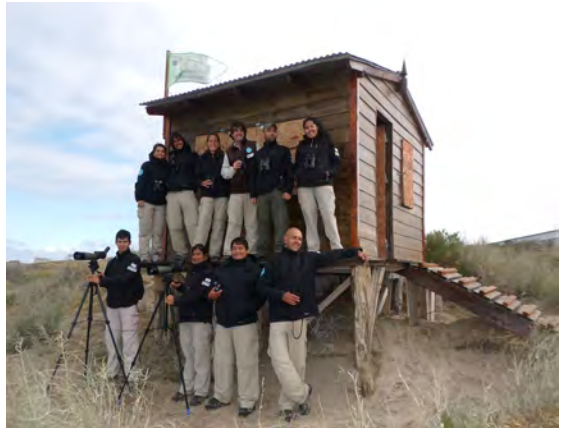
Rangers protect shorebirds and their habitats and educate the public about the needs of migratory shorebirds.

Field Partners: Fundación Inalafquen (San Antonio); Asociación Ambiente Sur (Rio Gallegos); Conservación Marina (Chile)