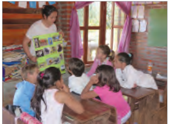
Children learn about the needs of wildlife in their communities.