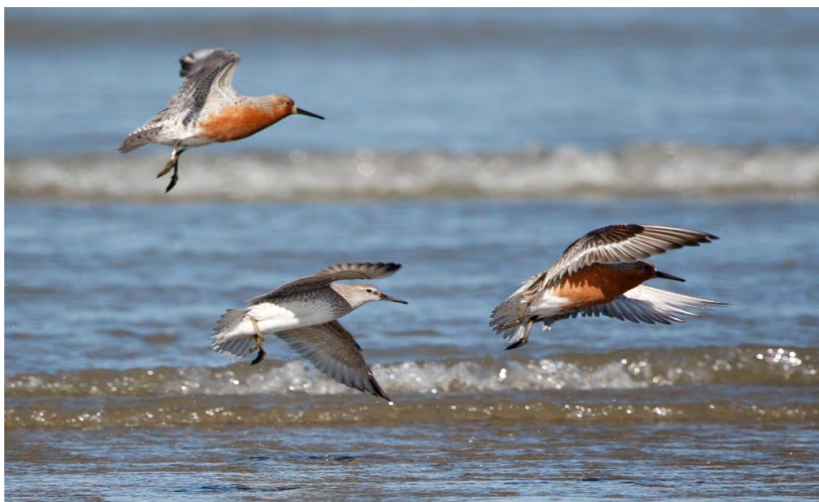
Red knots ready for migration.

Our prospective project in Suriname (a super important region for shorebirds) needs support.