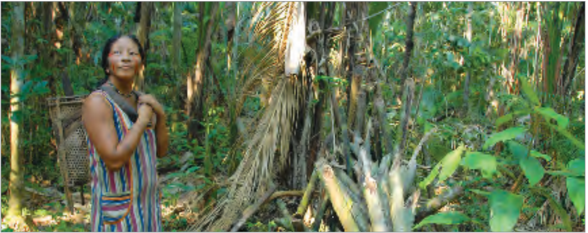
A Kayapo woman in forest.