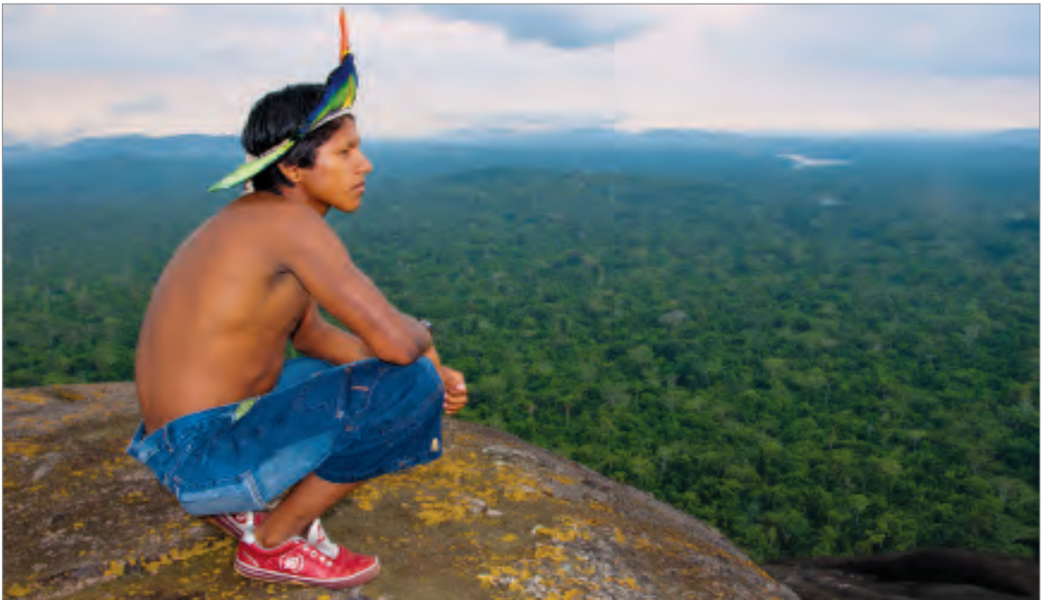
A Kayapó man looks out on his forest home.