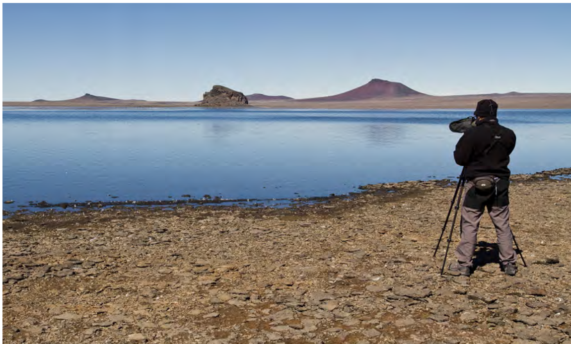
At work on a rare calm day for Patagonia.